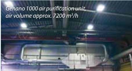
Genano 1000 air purification unit, air volume approx. 7200 m 3 /h

Genano Technology ® fulfills the requirements of a new generation of air purification technology. Our air-cleaning devices protect the premises, workers and production processes from harmful impurities. Genano Oy's mission is the improvement of work productivity through good quality indoor air. Our solution offerings can also improve the energy efficiency of the site and bring cost savings. We want to increase people's well-being at the workplace and to enhance production through particularly clean room air.